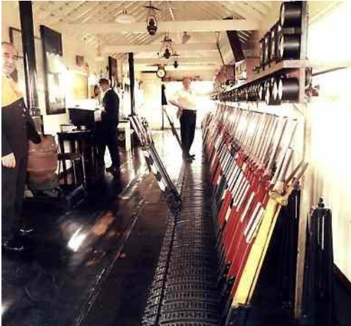
(Exeter West as it was in 1980)

The Exeter West Group was formed in 1982 to preserve for posterity the large G.W.R. signal box from the west end of Exeter St. David's station. Due to close in 1985 it was felt worth preserving because there was no scheme existing to save a large, busy box, and re-signalling on B.R. would soon render those surviving extinct. 'The Group' have now purchased the box and moved it to 'The Railway Age', Crewe. Here it has been re-assembled and equipped exactly as it was at Exeter, so that visitors are able to see what went on 'behind the scenes' in a busy box during the age of steam.