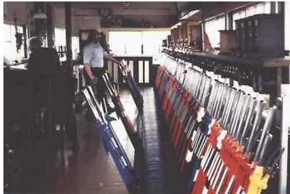
(Exeter West restored to its 1960 condition)

The demonstrations are based on the timetable for the summer of 1960 and so give anyone interested in mechanical signalling a real 'feel' for what the job was like in those days. Practical involvement also allows enthusiasts who may be involved with signalling on preserved railways to develop their knowledge and skills to a higher level.